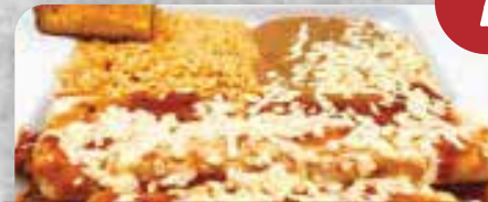
Burrito, enchilada, rice, and beans.