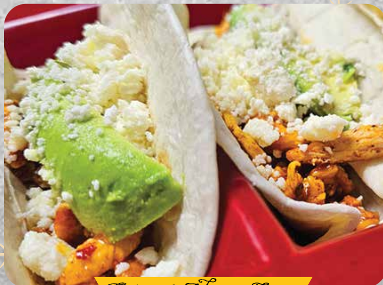
Chipotle Mango Tacos

Three shrimp or fish tacos with lettuce and cheese. Served with pico de gallo, rice and beans. 14.99