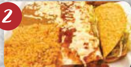
Burrito, taco, rice, and beans.