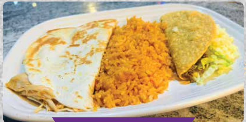
Lunch Combo 3