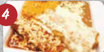
Enchilada, chimichanga, rice, and beans.