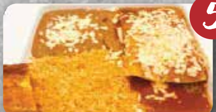
Two enchiladas, rice, and beans.