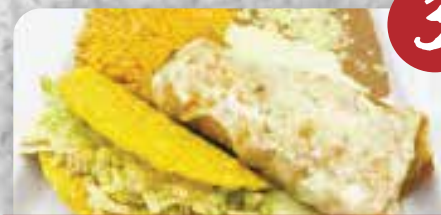
Chimichanga, taco, rice, and beans.